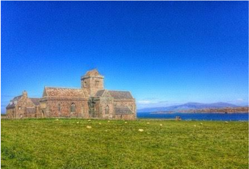
The Abby at Iona, Scotland “A thin place”

Fourteenth Sunday after Pentecost Holy Eucharist – Iona Liturgy with Baptism August 21, 2016 – 10:30 a.m.